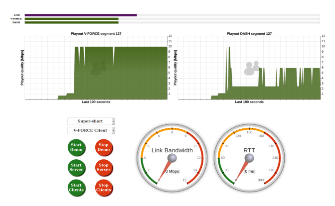
Figure 4: The HTML5 dashboard allows to fully control the demo setup and monitor the performance of the video clients.

awareness. The rate adaptation heuristic embedded into the HAS clients is the FINEAS algorithm [8].